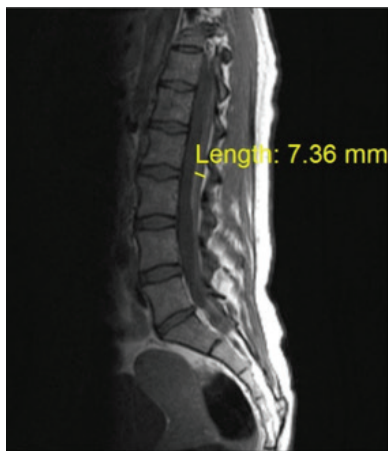
Fig 1. Sagittal T1-weighted LS MRI scan shows acute spinal subdural hematoma from vertebral body L1 to L4.

matoma of up to 7.3 mm in T1 sequence, in the dorsal part of the spinal canal at the level of L1 vertebra to the inferior endplate of L4 vertebra (Figs. 1-4). The patient was examined by a neurosurgeon who indicated repeat LS MRI scan after three hours, which showed unchanged result. The next day, the patient was clinically better and pain in the LS region was in regression. Follow up MRI scan performed 24 hours after lumbar puncture showed no changes. During hospital stay, the patient had normal sphincter control without motor and sensory deficit. Laboratory findings were normal, and so were coagulation parameters.