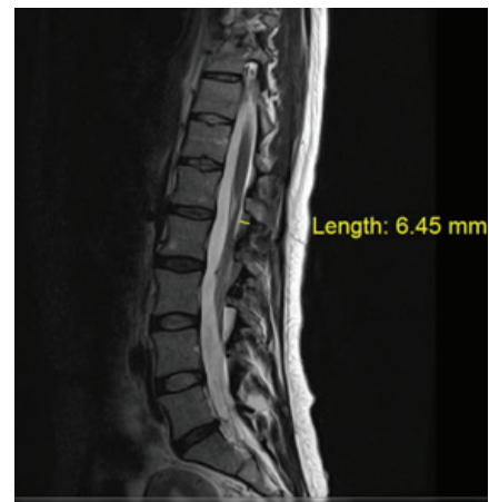
Fig 2. Sagittal T2-weighted LS MRI scan shows acute spinal subdural hematoma from vertebral body L1 to L4.